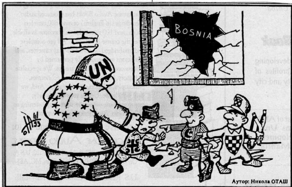
How a Bosnian Serb army newspaper sees the conflict: the West punishes a little Serb for misdeeds committed by a Muslim (centre) and a Croat (right)

Wall Street Journal, Milwaukee Sentinel, The Economist, InterNet, FBIS Daily Reports.