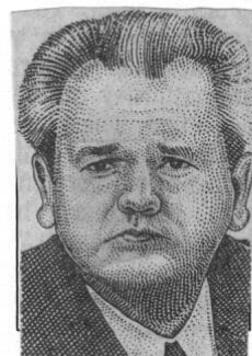
Milosevic President of Serbia