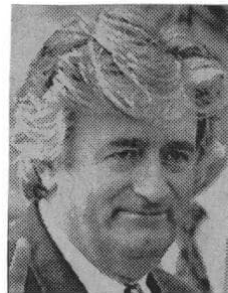
Karadzic Leader of Bosnian-Serbs