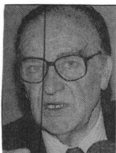
Izetbegovic President of Bosnia