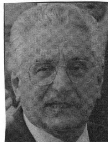
Tudjman President of Croatia